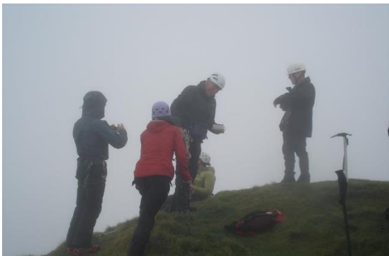
The gloomy summit of Boreray